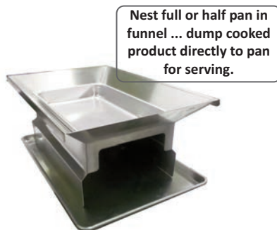
Nest full or half pan in funnel ... dump cooked product directly to pan for serving.