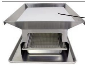
With Cutting Board in use

The versatile Xpress-peditor Counter-Top Landing Table System offers multi-functional support for busy foodservice operations.