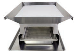
Put an 18x26 Sheet Pan on top of funnel and use the provided 15x20 Cutting Board as an addition prep station. Drippings and scrap are contained in the pan, making clean-up quick and easy.