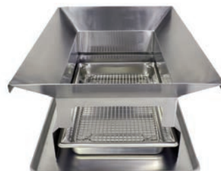
FIFO rotation system ... place full pan of fresh product under funnel ... dump older unsold product on top, then place pan for serving.