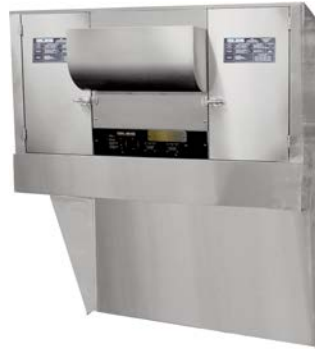
FSH-3.5 is available in either free-standing or ceiling/wall mounting option.