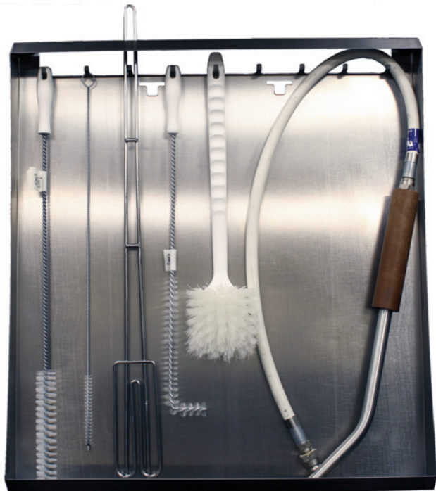
Tools & Accessories Sold Separately

"A place for everything and everything in its place" ... this unique accessory is a must have item for anyone operating Electric or Gas Fryers.